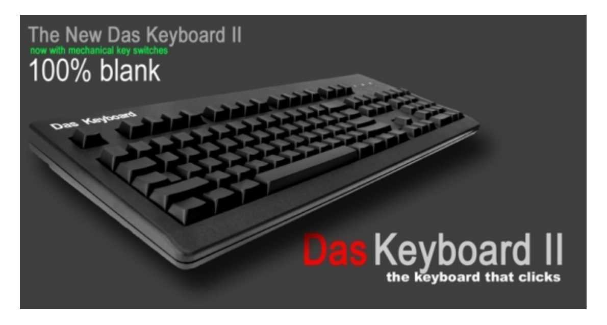
Figure 2: Blank Keyboard

In another interesting example, the TRIZ principle of "trimming" has been used to remove letter and numbering on computer keyboards, which turns out to allow proficient typists and computer users to type 17% faster due to not being distracted by the sight of printing on the keys.