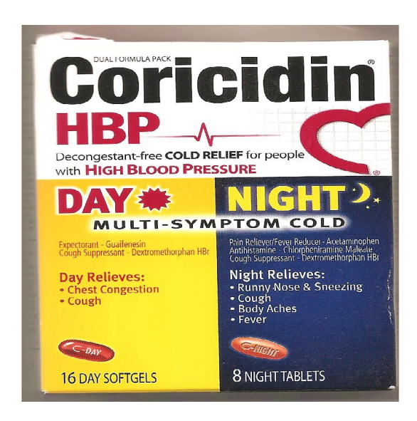
Figure 4: Day and Night Cold Medicine in One Package

Let's look at another recent product package design change that does not involve any significant increase in cost, but keeps pills in the proper proportion in one package.